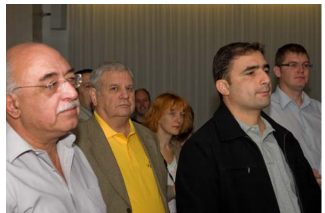
Those damned Butler scores must lie!

This contract ended in one down, also for 100.